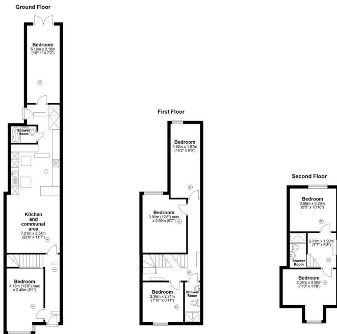
Heeley Rd, Selly Oak, Birmingham